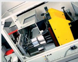
Die-cutting with counterpressure