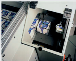
Stack loading process