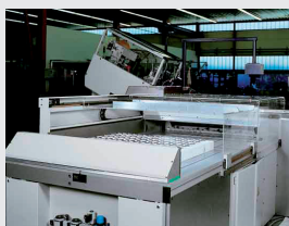
Strip stack infeed