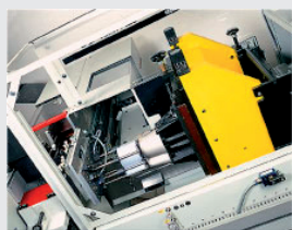
Die-cutting with counterpressure